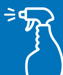
Clean High-Contact Surfaces