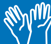
Use Gloves with Food, Restroom Help, and Diapering

For safety, each classroom will only be used for one service hour. This allows us to make sure your child is in a clean environment at the beginning of each class period.