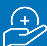
Frequent Hand-Washing & Sanitizing

Here are our safety protocols we uphold while your little ones are in our care: